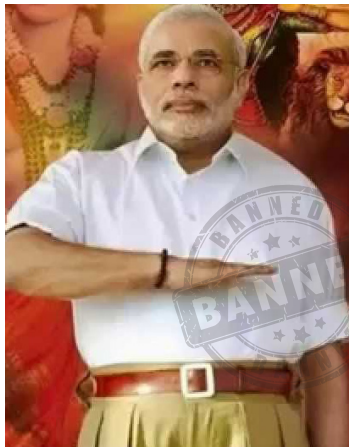
Prime Minister Narendra Modi seen in the RSS Uniform doing the RSS Salute.

Before becoming the Prime Minister of India, Narendra Modi had been banned from entering the United States and the UK for nine years because of his role in the 2002 massacre of Muslims in the Indian state of Gujarat. Modi was able to travel to the US only after being elected on account of the immunity granted to heads of state. He remains the only person ever to be banned to travel to the US under the International Religious Freedom Act provision of the US Immigration and Nationality Act (INA) 24